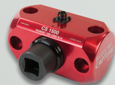
CS 1500 Sensor

Torqueleader Sales Hotline +44 (0) 1483 894 476 or visit www.torqueleader.com