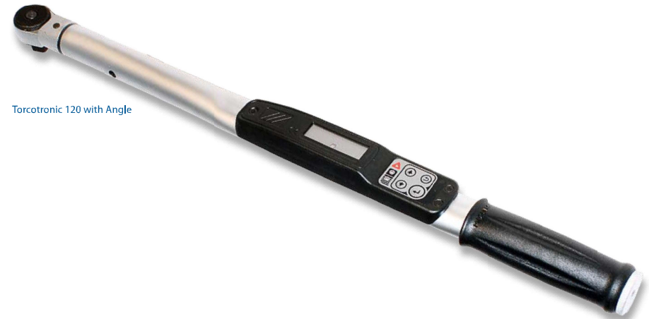
Torcotronic 120 with Angle

For more information: Tool Selector; gedore-torque.com/tool-selector Telephone; +44 (0) 1483 894 476 Videos; www.youtube.com/gedore-torque Email; salesandrepairs@gedore-torque.com