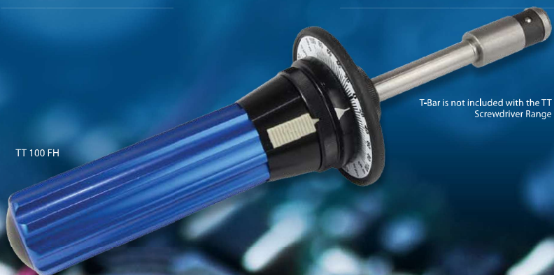
T-Bar is not included with the TT Screwdriver Range

cost and versatile tools provide accuracy, reliability and economy in a wide range of Maintenance and Repair, Quality Control, R & D and Assembly operations in any engineering or manufacturing environment.